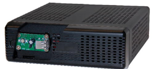
USB 2.0 Ports concealed under front cover are ideal for the installation of hardware license keys or wireless network (Bluetooth / WiFi) adapter cards